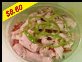
Large Turkey Serves 2