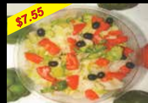
Extra Large Dinner Salad Serves 4