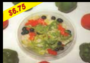
Large Dinner Salad Serves 2