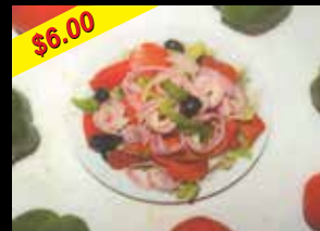
Small Antipasto Serves 1