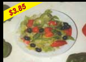
Small Dinner Salad Serves 1