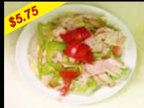
Small Turkey Serves 1