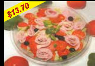
Extra Large Antipasto Serves 4