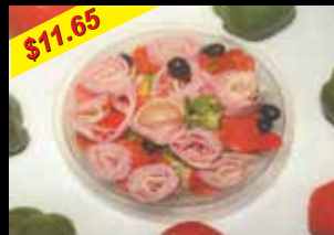
Large Antipasto Serves 2